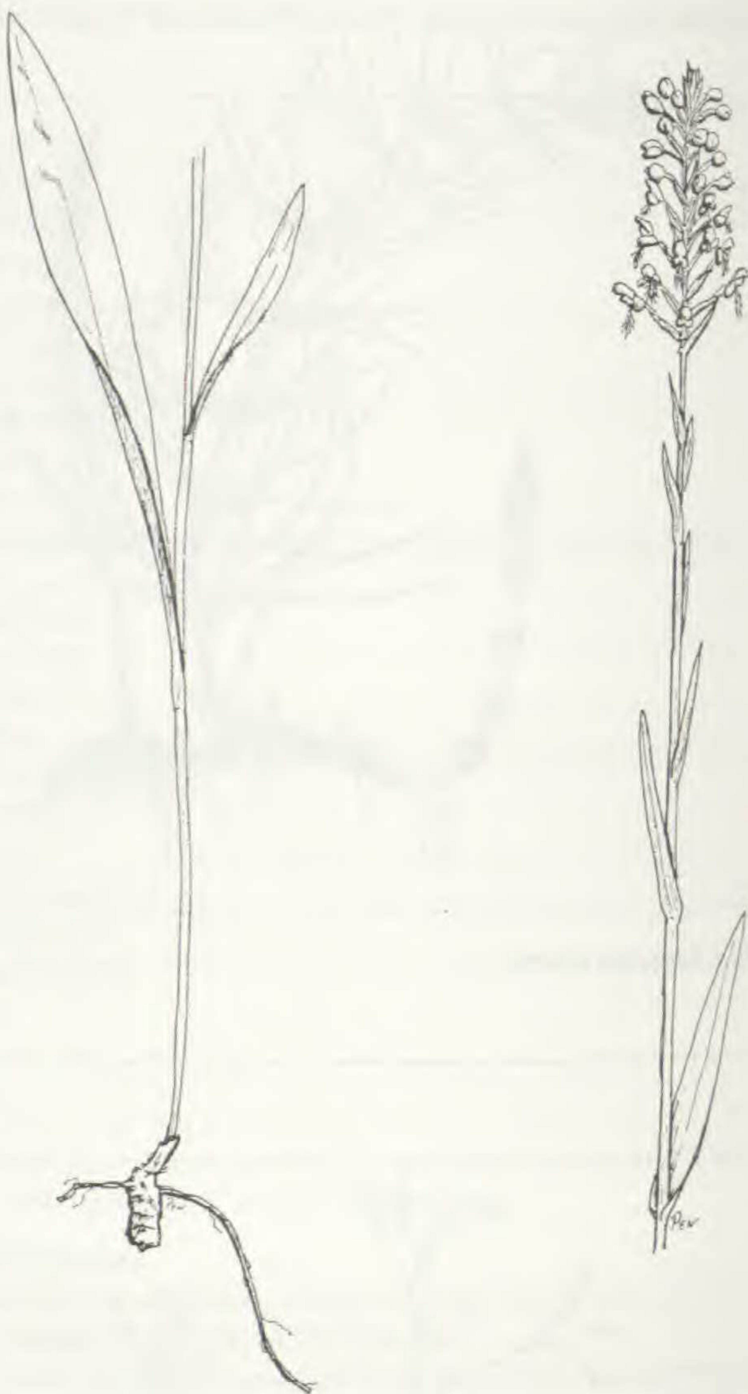
FIG. 7. Platanthera cristata .